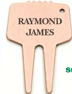
MDF-66 Steel TEELINE Divot Fixer