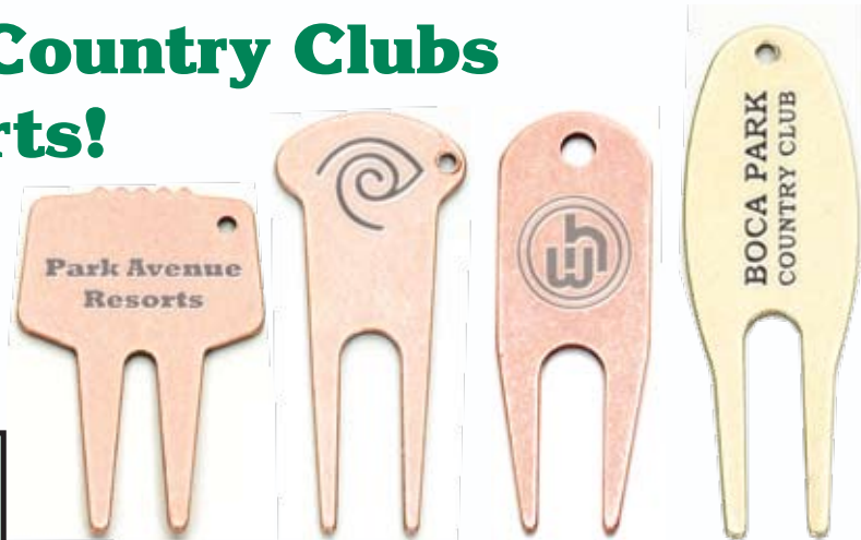
MDF-66DS Steel TEELINE Divot Fixer