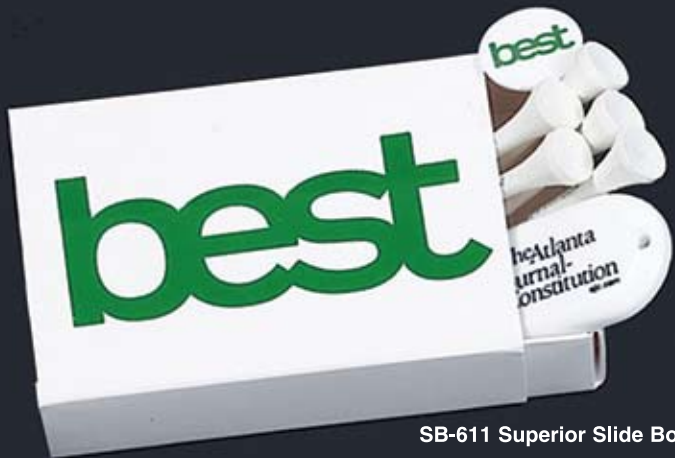
SB-611 Superior Slide Box