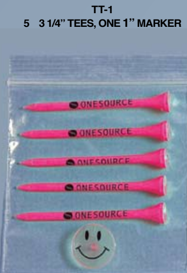
TT-1 5 3 1/4" TEES, ONE 1" MARKER