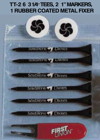
TT-2 6 3 1/4" TEES, 2 1" MARKERS, 1 RUBBER COATED METAL FIXER