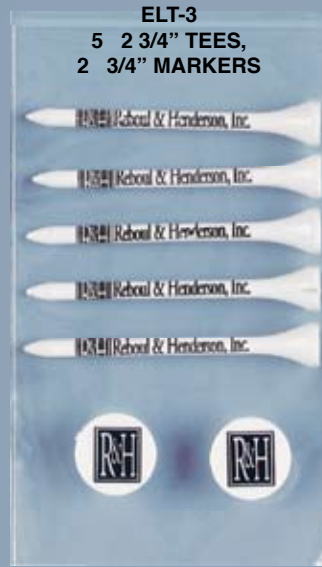
ELT-3 5 2 3/4" TEES, 2 3/4" MARKERS