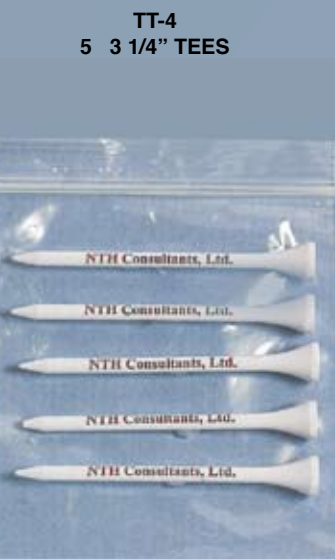
TT-4 5 3 1/4" TEES