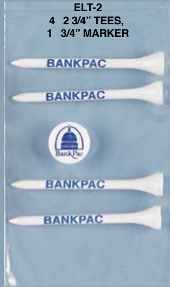
ELT-2 4 2 3/4" TEES, 1 3/4" MARKER