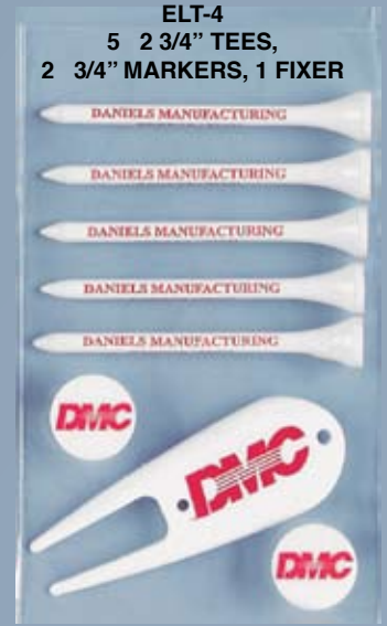
ELT-4 5 2 3/4" TEES, 2 3/4" MARKERS, 1 FIXER