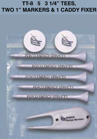
TT-8 5 3 1/4" TEES, TWO 1" MARKERS & 1 CADDY FIXER