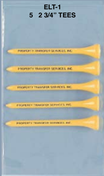
ELT-1 5 2 3/4" TEES